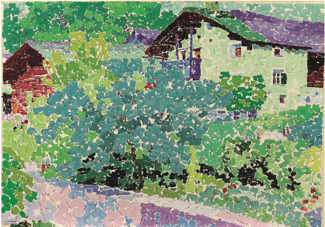
Augusto Giacometti: “Der Garten” 1912, oil on canvas, 64 x 91 cm, Bündner Kunstmuseum Chur, Depositum Privatbesitz.

A pilot project merging art and technology