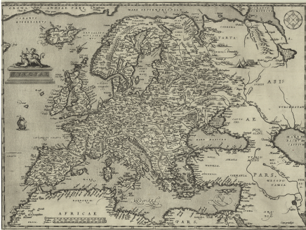
Europae, Ortelius Abraham [1570]. Universitätsbibliothek Basel, Kartenslg AA 12.